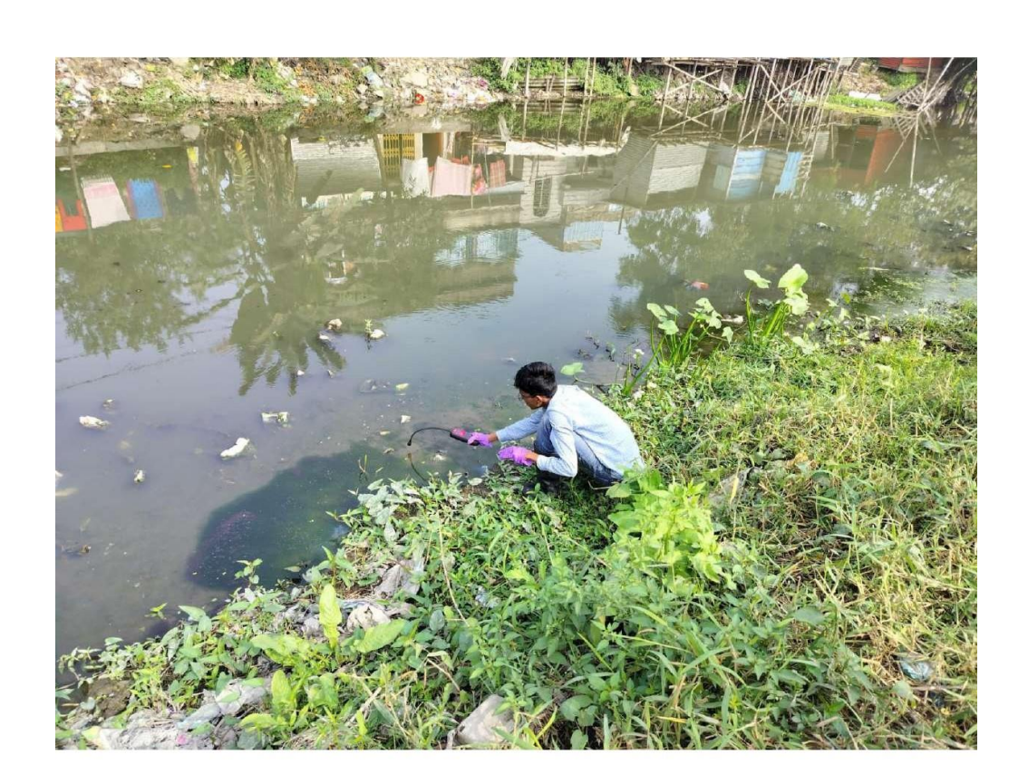
Collection of waste water from Noai-Khal

Recognised Under UGC 2F&12B WB Govt. Aided Affiliated to The University of Burdwan